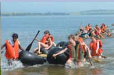
All girl crew leap off their raft to take well deserved first place.